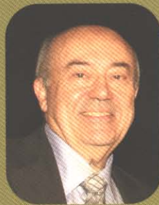
Andrew J. Viterbi

USC University Professor and George T. Pfleger Chair in Electrophysics