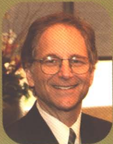
Leonard M. Adleman

USC Distinguished Professor and Henry Salvatori Professor of Computer Science